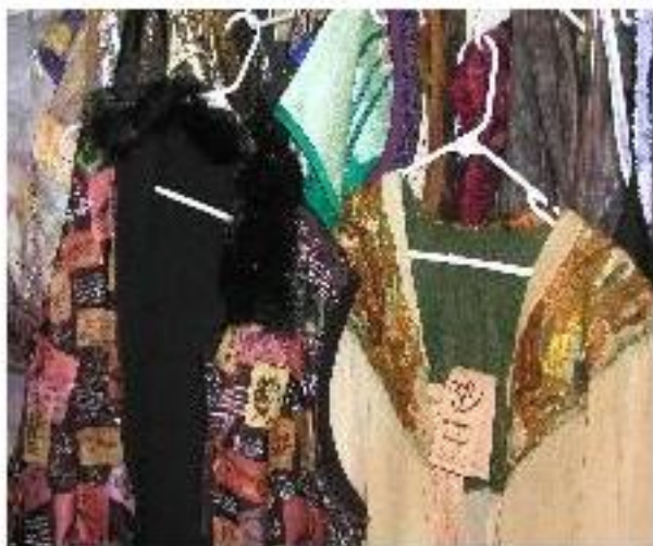
Waiting for their 15 minutes of fame