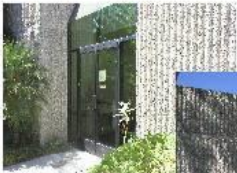
The Offices of Belle Armoire