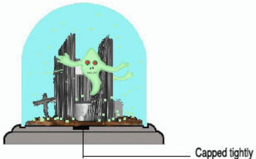
illustration by Garie Sim