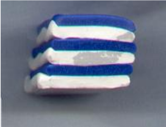
The striped or stacked cane