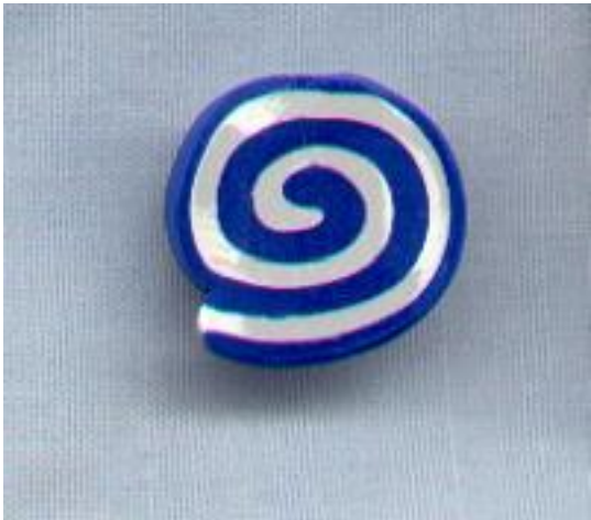
The jelly roll or spiral cane

When it comes to basic canes, there are really only three: