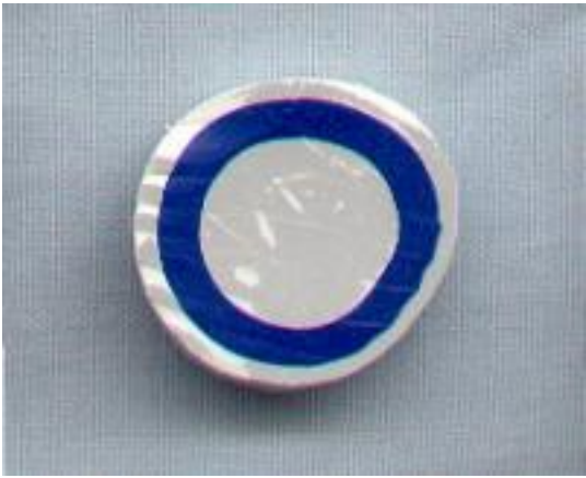
The bull's-eye cane