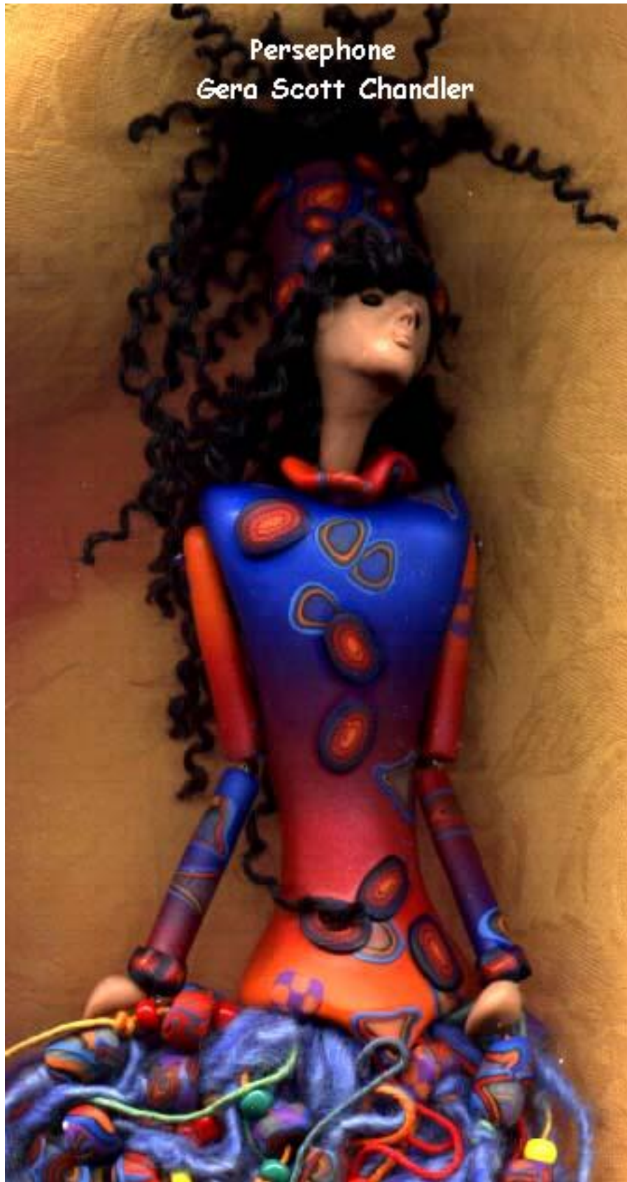
Approx. 34" tall; polymer clay, handspun and hand-dyed wool, assorted fibres, glass & handcrafted polymer clay beads.