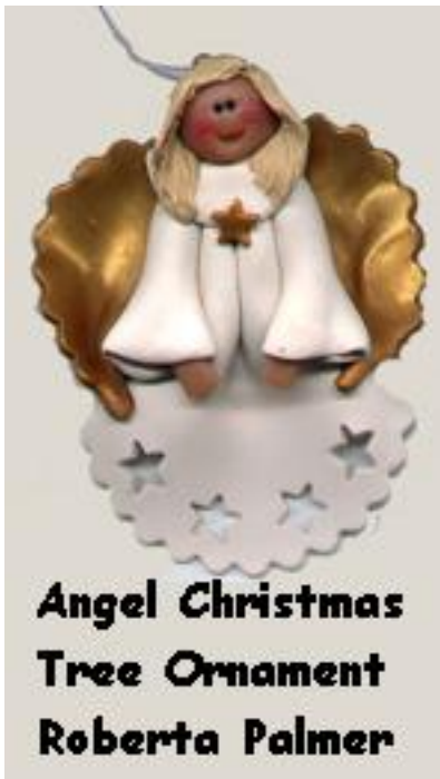
Angel Christmas Tree Ornament Roberta Palmer

For this week-long event, members stay at a chalet, share kitchen detail, and participate in all-day clay workshops and technique study sessions. Social activities are not neglected: Clayamies love to bond over a latte or a goblet of du bon vin rouge! In its beautiful forested setting, Tremblant offers lots of opportunity for outdoorsy types to take a break from claying--to walk, hike, or go for a paddle.