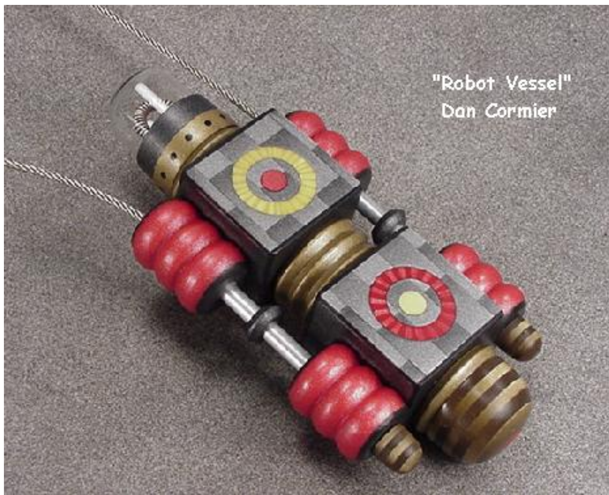
Tin Toy Vessel: 4 inches tall, strung on cable, opens.

We organise all kinds of clay-centred projects, both in cyberspace and on the ground. Swaps are our raison d'etre, of course, but we also have an on-going RAC (Random Acts of Clayness) project in which members exchange surprises by snail mail.