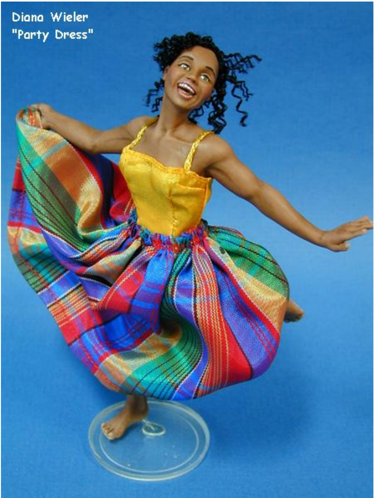
Miniature polymer clay doll: 5 1/5 inches tall