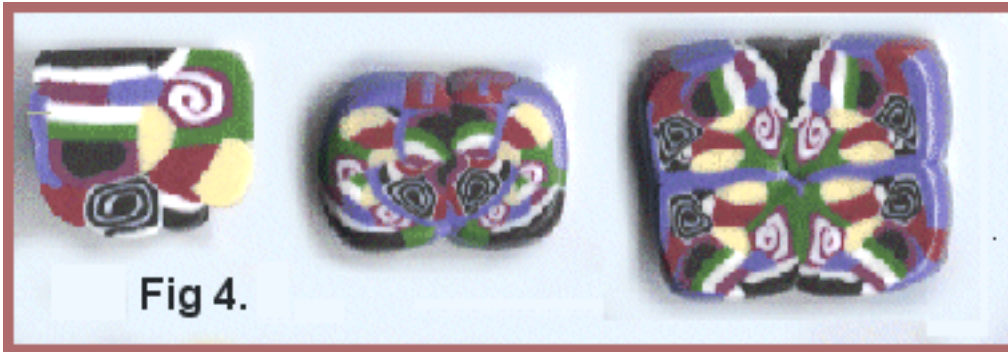
Fig. 4 shows the original assemblage and two mirror-imaged results.

Build your new cane into one that is at least 2.5 cm (1 inch) thick and 5 cm (2 inches) long, as any smaller might make it difficult to reduce the cane without losing definition. This is another reason for using contrasting colours, or at least separating components with a contrast strip.